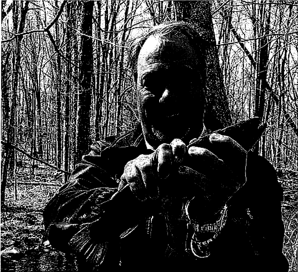
DA Hoovler helping the Orange County Federation of Sportsmen to stock trout